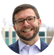
John Mlade Wight & Co.